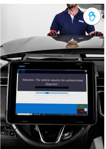
"Do you want to proceed with the Gateway unlock?