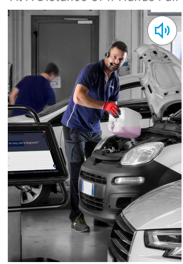
"Hey TEXA, start diagnostic scan"

Allow Activating Functions At A Distance Or If Hands Full