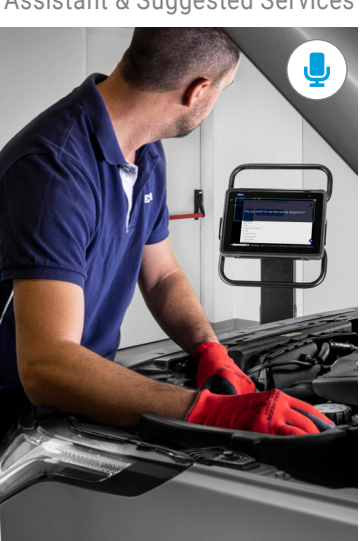
"Hey TEXA, zoom in the parameter"